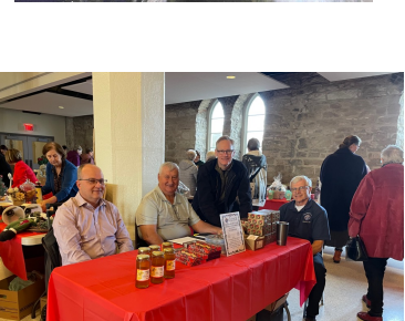
Photo above: Knights' Annual sale of Christmas Cakes, cookies and honey